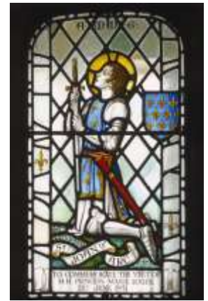
St Joan of Arc, Pray for Us.