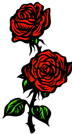
Mystical Rose Pray for Us.