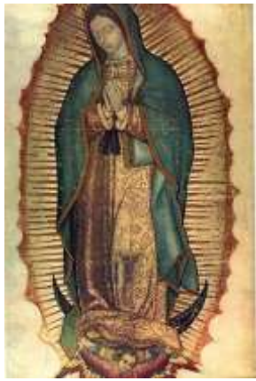
Our Lady of Guadalupe, Pray for Us.